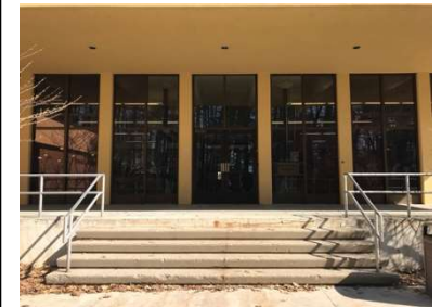
Osterlin Building – Main Entrance