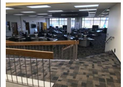
Osterlin Building – Student Success Ctr