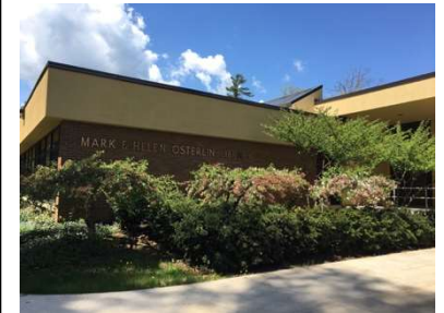
Osterlin Building – SE Exterior